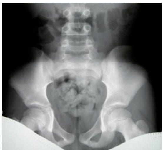
Figure 3: Abdominal radiograph, 48 hours after accidental ingestion, showing no evidence of any foreign body.

clinical complications and subsequent legal proceedings. Orthodontic appliances or parts of them can be accidentally aspirated or swallowed. The presence of any foreign body in the airway is less common, but it needs to be treated as a serious situation because an aspirated foreign object can constitute a true medical emergency.